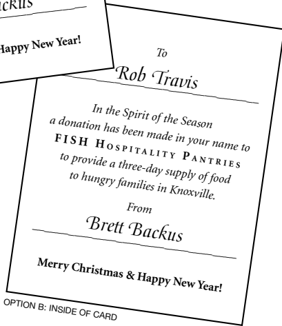
OPTION B: INSIDE OF CARD

*The cover of OPTION A is red, green and gold. The cover of OPTION B is red, green and silver.